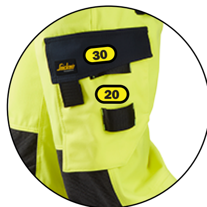
Left side of toruser